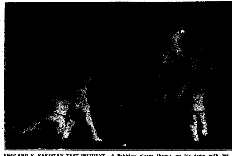
ENGLAND V. PAKISTAN TEST INCIDENT—A Pakistan player throws up his arms with joy as Compton is caught behind the wicket after scoring 53, during the fourth cricket test match between England and Pakistan at the Oval, recently.